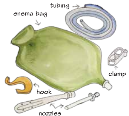
Large-volume enema kit