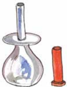
Liquid glycerin suppository

"We were nervous to try the large-volume enema with my 8-year-old, but it isn't as scary as I thought it would be, and my daughter finds them more comfortable."